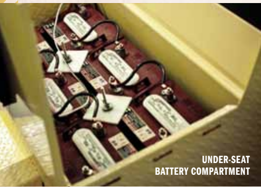
UNDER-SEAT BATTERY COMPARTMENT