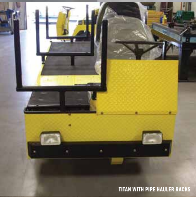
TITAN WITH PIPE HAULER RACKS

THERE'S NO TASK TOO BIG, NO JOB TOO UNIQUE.