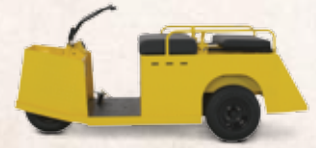
300-LB CARGO DECK

With the Minute Miser, you won't waste a second of your day. This versatile, energy-efficient vehicle is built for efficient transportation, so you can get where you need to go quickly and safely.