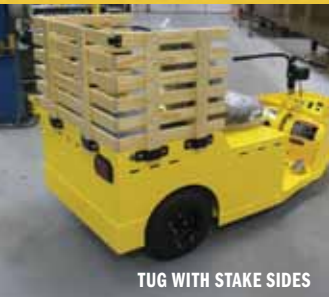
TUG WITH STAKE SIDES