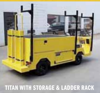
TITAN WITH STORAGE & LADDER RACK