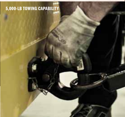
5,000-LB TOWING CAPABILITY