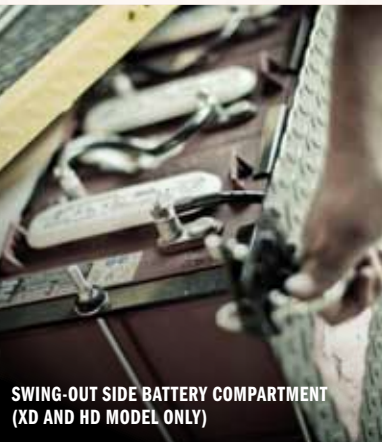
SWING-OUT SIDE BATTERY COMPARTMENT (XD AND HD MODEL ONLY)