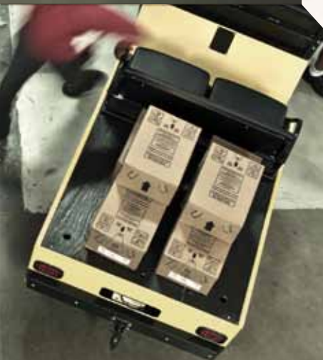
21.6-SQ-FT CARGO DECK

21.6-sq-ft cargo deck with 1,750-lb payload capacity