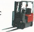
7FBCU15.18 4 Wheel Electric