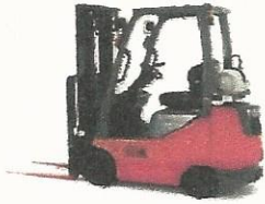
8FGCU15-18 8FGCSU20 IC Small Cushion