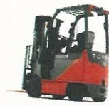
8FBCU20-32 4 Wheel Electric