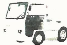
2TE15.18 Electric Tow Tractor