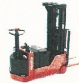
6BWC10-20 Counterbalanced Stacker