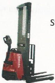
7BWS10.13 Adjustable Baseleg Straddle Stacker