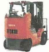
7FGCU35-55 BCS IC Large Cushion Box Car Special