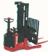
6BWR15 Electric Walkie Reach Truck