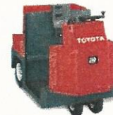
CTBY4 Stand up tow tractor