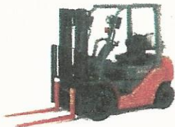
8FGU15-32 IC Pneumatic