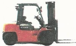
7FGU35-AU50 IC Pneumatic