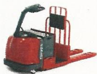
8HBC30.40 Center Control Rider