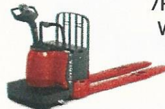
8HBE30.40 End Control Walkie Rider