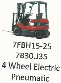
7FBH15-25 7B30.J35 4 Wheel Electric Pneumatic