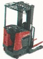
8BRU18.23-8BDRU15 Reach Truck