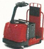
8TB50 Tow Tractor