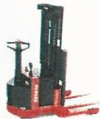
6BWS11-20 Straddle Stacker