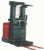
6BPU15 Order Picker