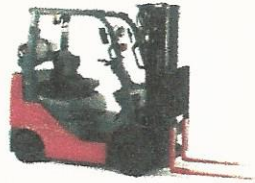
8FGCU20-32 IC Cushion