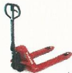
HPT25 Hand Pallet Truck