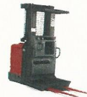
7BPEU15 Order Picker