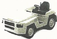
2TDU25 Diesel Tow Tractor