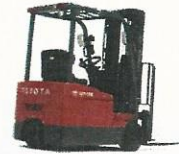
7FBEU15-20 3 Wheel Electric