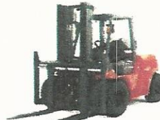
7FGU60-80 IC Pneumatic