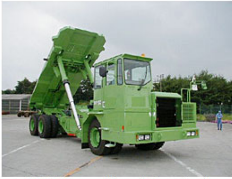
DP50 (separable pallet version)