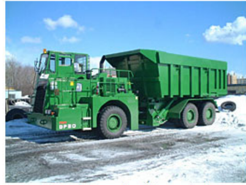
DP30 (integral pallet version)