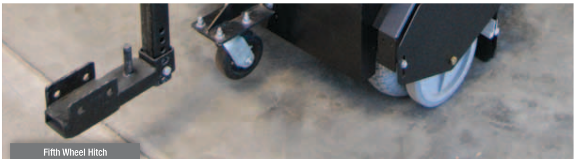
Fifth Wheel Hitch