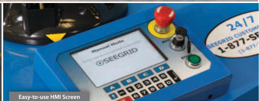
Easy-to-use HMI Screen