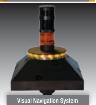
Visual Navigation System