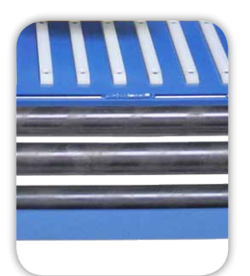
Compartment Rollers & Rear Friction Strips