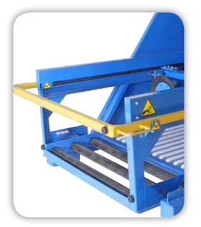
Battery Containment Bar