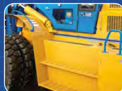
ENTRY/EXIT W/ 3-POINTS OF CONTACT