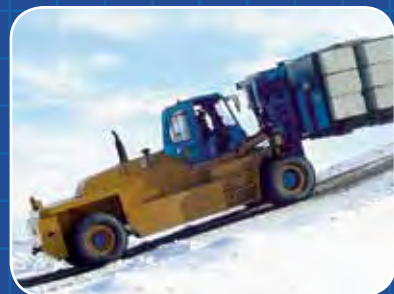
40% GRADE-ABILITY FOR SEVERE OFF-ROAD ABILITY