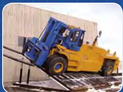
BUILT IN SAFETY THRU ANSI B56.6 CERTIFICATION