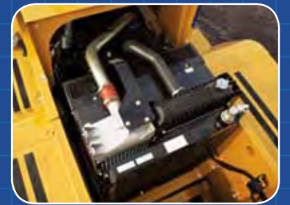
ACCESSIBILITY UNDER THE HOOD