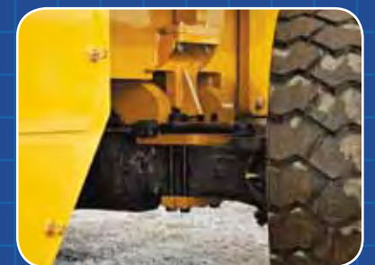
OSCILLATING REAR AXLE & WET DISC BRAKES