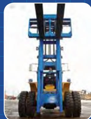
EXCELLENT MAST VISIBILITY