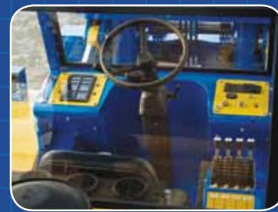
ALL STEEL, SPACIOUS CAB INTERIOR