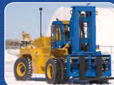
FULL TIME 4-WHEEL DRIVE FOR REAL LIFE APPLICATIONS