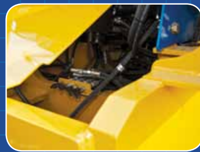
HYDRAULIC TEST PORTS & HOSE GUARDS SENSIBLY LOCATED