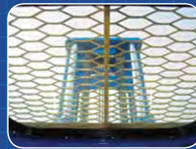
FOPS CANOPY WITH RAIN PROTECTION STANDARD EQUIPMENT