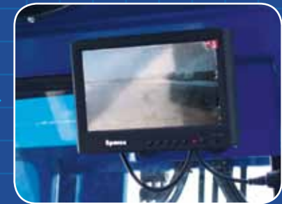
BACK-UP CAMERA STANDARD EQUIPMENT