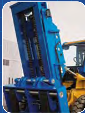
HEAVY DUTY MAST & CARRIAGE FABRICATED USING T1 / QT100 STEEL