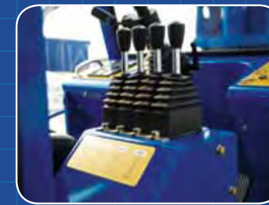
ERGONOMIC, PROPORTIONAL CONTROLS