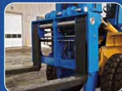
FORK POSITIONER & SIDE-SHIFT STANDARD EQUIPMENT