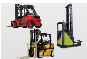
Used / Rental / Leasing