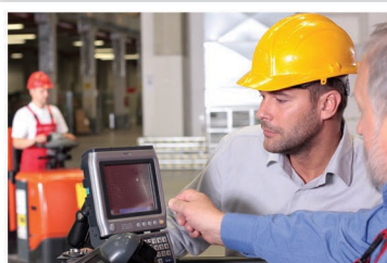
Telemetry & Fleet Mgmt.