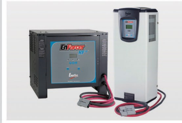
Batteries & Chargers