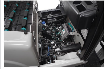
Parts & Service Support