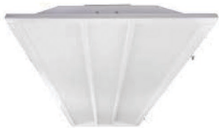
3 Panel Opaque Matte Lens

To schedule a survey of your facility or for more information, please contact: