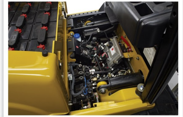
Parts & Service Support