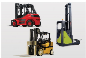
Used / Rental / Leasing