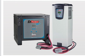
Batteries & Chargers