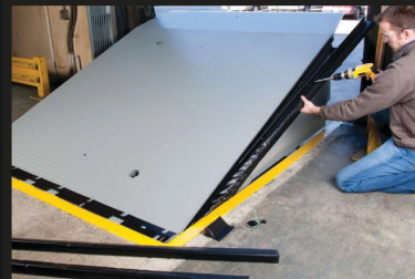
Parts & Service Support